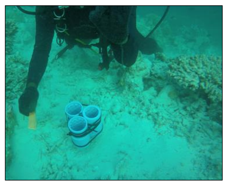
Figure 2-1: Sedimentation trap installed for sedimentation rate monitoring