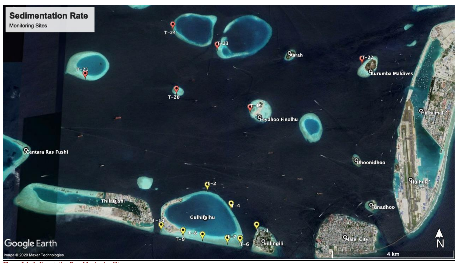
Figure 3-1: Sedimentation Rate Monitoring Sites