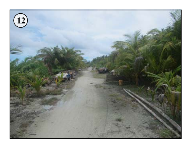
Proponent: Ministry of Environment and Energy Consultant: Sandcays