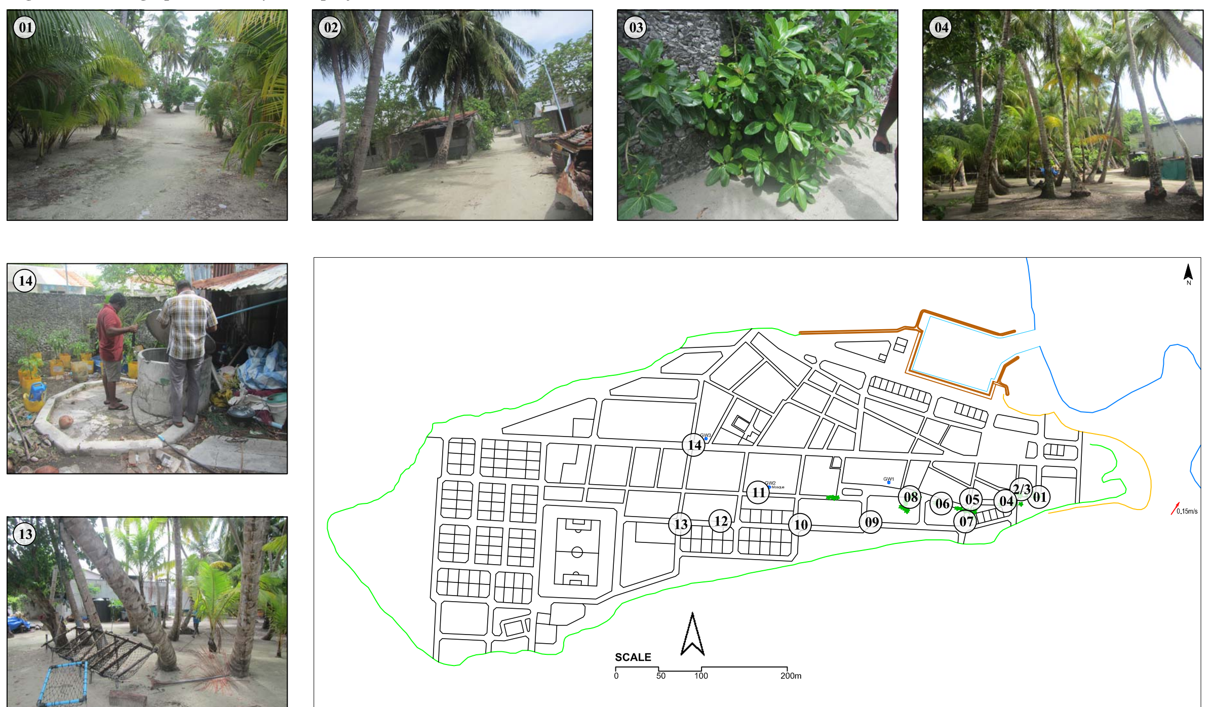
Figure 3-2: Photographic summary of the project areas