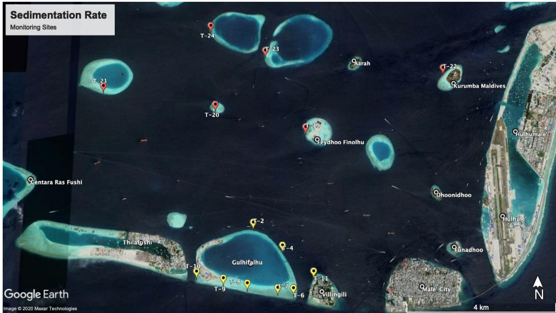
Figure 3-1: Sedimentation Rate Monitoring Sites