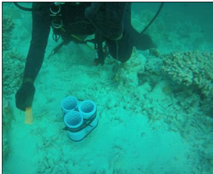
Figure 2-1: Sedimentation trap installed for sedimentation rate monitoring