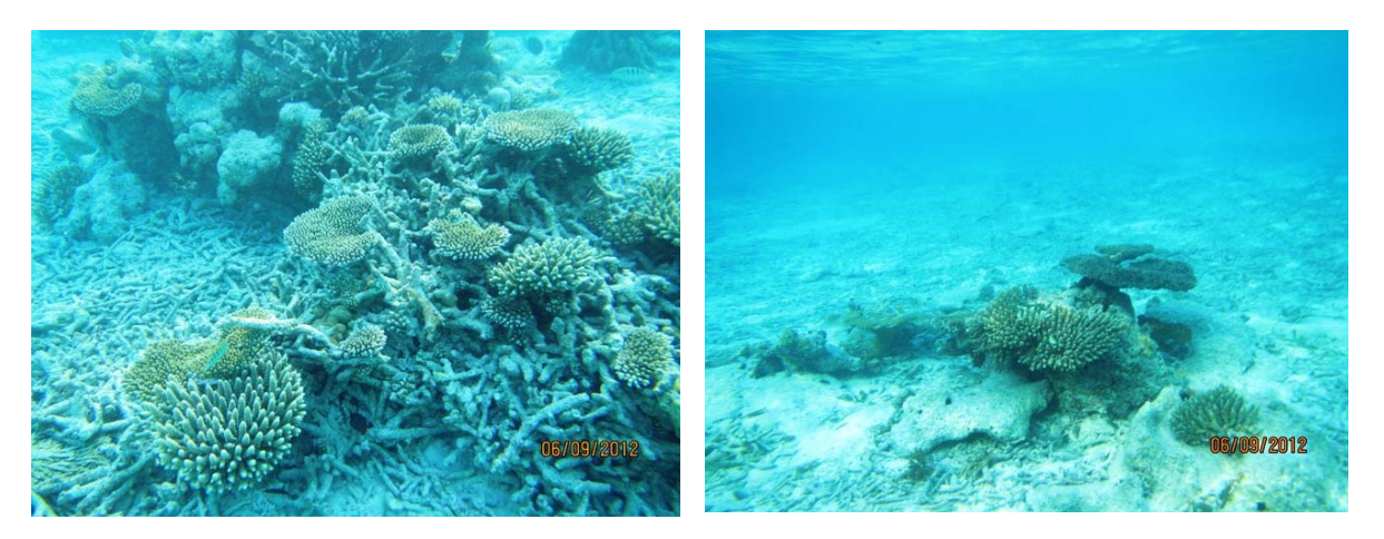
Figure 5 : Sample images from the reef close to the sandy lagoon just in front of the proposed development area.

It is normal to observe large changes in substrate cover and composition even within spatial scales of less than few tens of square meters. Such observations were seen in the area surveyed.