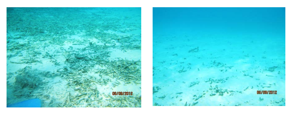
Figure 4: Sample images of lagoon – the area where the new over-water bungalows will be built.

Lagoon Substrate: The lagoon area marked in Figure 3 has a substrate of coarse sand. Areas closer to the existing over-water bungalows is completely devoid of corals expect in few area where broken pieces of Acropora (Figure 4 right). The sand is soft and so it is likely to cause to some amount of sediment suspension and turbidity during placement of concrete footings. In areas closer to the reef the amount of broken Acropora on the substrate is significantly increased (Figure 4 left).