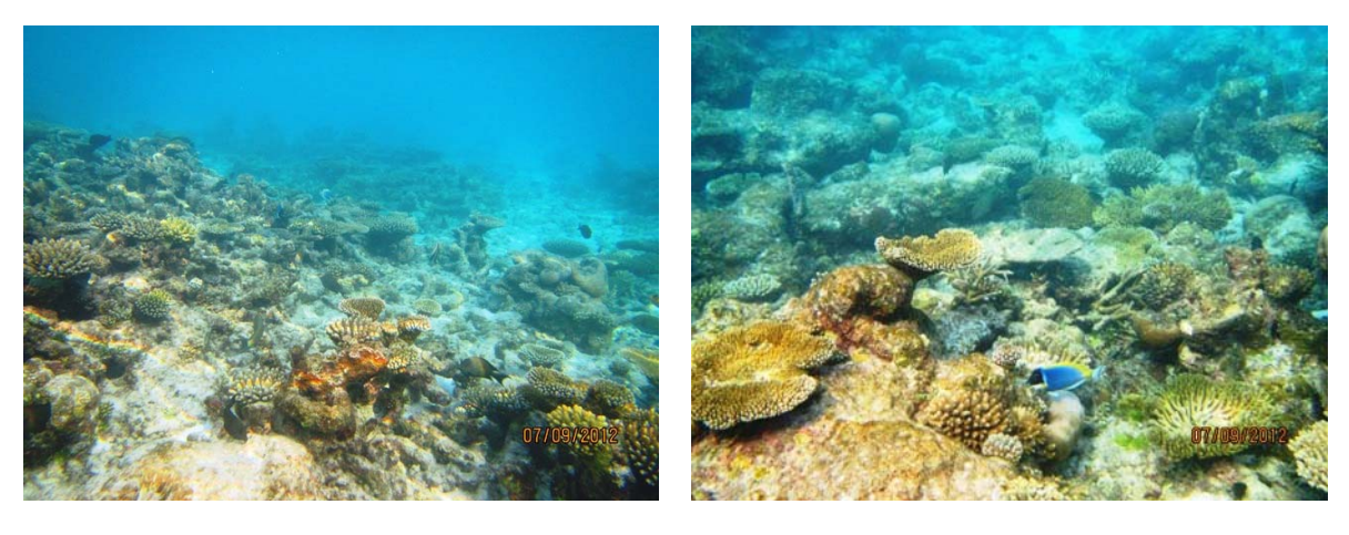
Figure 6: Typical images form reef top in front of the proposed development.

The composition of the substrate changes from the coarse sandy floor to coral rubble laden to live coral covered area as one moves away from the area.