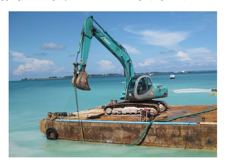
Figure 1: An excavator mounted on barrage will be used to deploy the concrete footings at the site.

The lagoon area of the proposed development is about 1.5-2.0 m deep and so a hatched-barge will be used as a working platform. An excavator will be mounted on the barge for burrowing (or digging) and deployment of the footings (Figure 1).