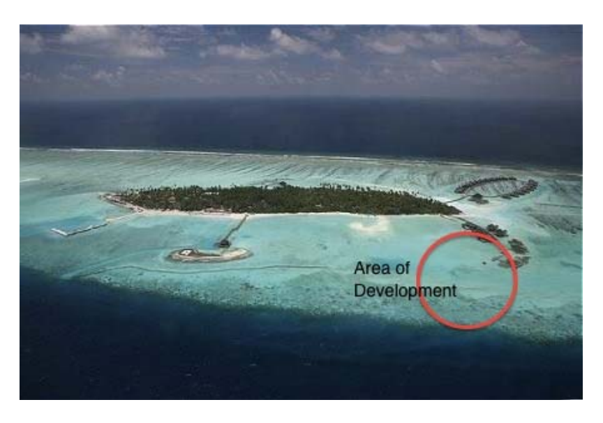
Figure 3: Image of the island the surrounding areas to show the lagoon and are where development relating to scope change takes place.

A reef survey was carried out on 06 September 2012. Sequence of underwater photographs in the area marked development in Figure 3 was obtained. As expected the images revealed a substrate of coarse sand devoid of any hard corals. Pieces of broken Acropora sp. (branching coral) was founded in some areas. Towards the reef edge, however reef however, lives coral cover was significant. There were no obvious signs of damage or degradation caused by the construction activity.