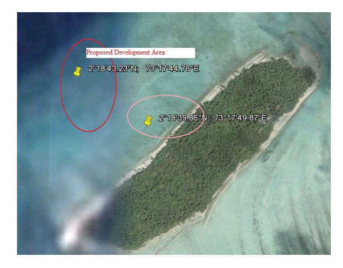
Figure 7: Area to show the water sampling location; Sample #1: Proposed Development Area; Sample #2: General lagoon area.

Water Quality : Water samples were taken from two locations, one in the general lagoon area and other from the area of the development (Figure 7). The test results show that water quality is normal. The water was clear and with no traces of turbid conditions. The water quality results are given in Annex 3.